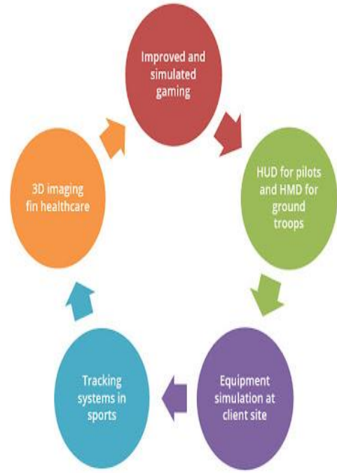
Figure-2. 5 most stunning real-world applications of Augmented Reality, Source[2]

This manuscript aims to provide a detailed analysis of the impact of VR and AR on modern software applications by examining current trends, reviewing relevant literature, and presenting new insights from statistical analysis. We explore the transformative effects of these technologies on user experience, interface design, and the overall software development process, while also addressing challenges such as