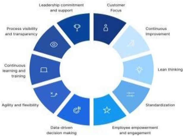
The 10 core principles of operational excellence